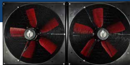
Robust A-class quality fans