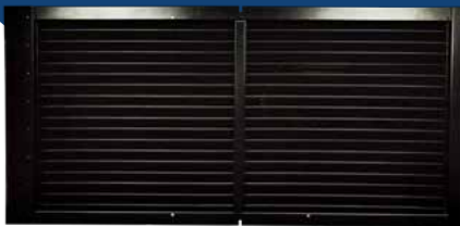
High air-capacity of 13.500 m 3 /hr